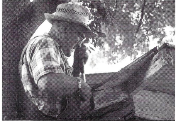
A "One Heart...Many Hands" volunteer repairs a roof at a project site.